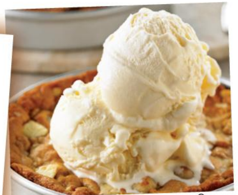
BJ'S FAMOUS PIZOKIE®

EVEN MORE REASONS TO SAY – “Wow – I love this place!”®