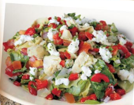
GARDEN MEDLEY SALAD